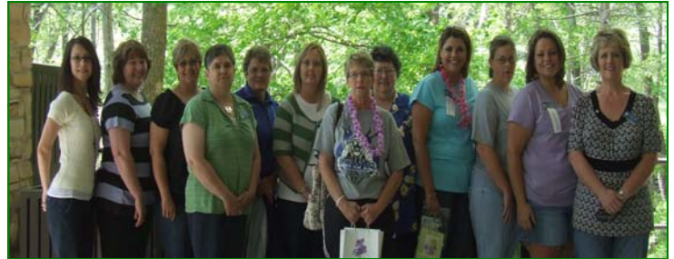
District 1 Northeast/Licking River