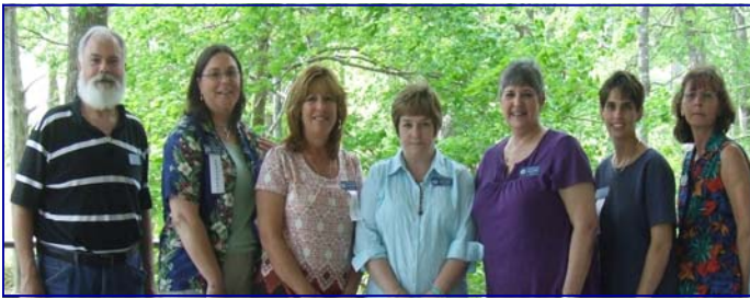
District 4 Ft. Harrod/Bluegrass