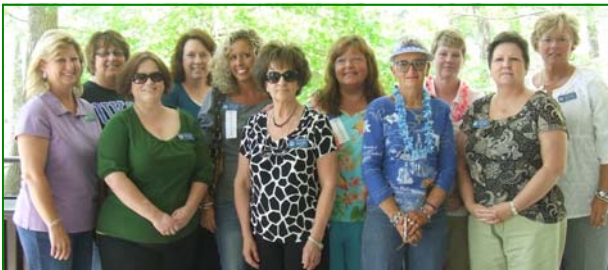
District 7 Purchase/Pennyrile