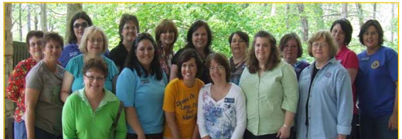
District 6 Green River/Mammoth Cave